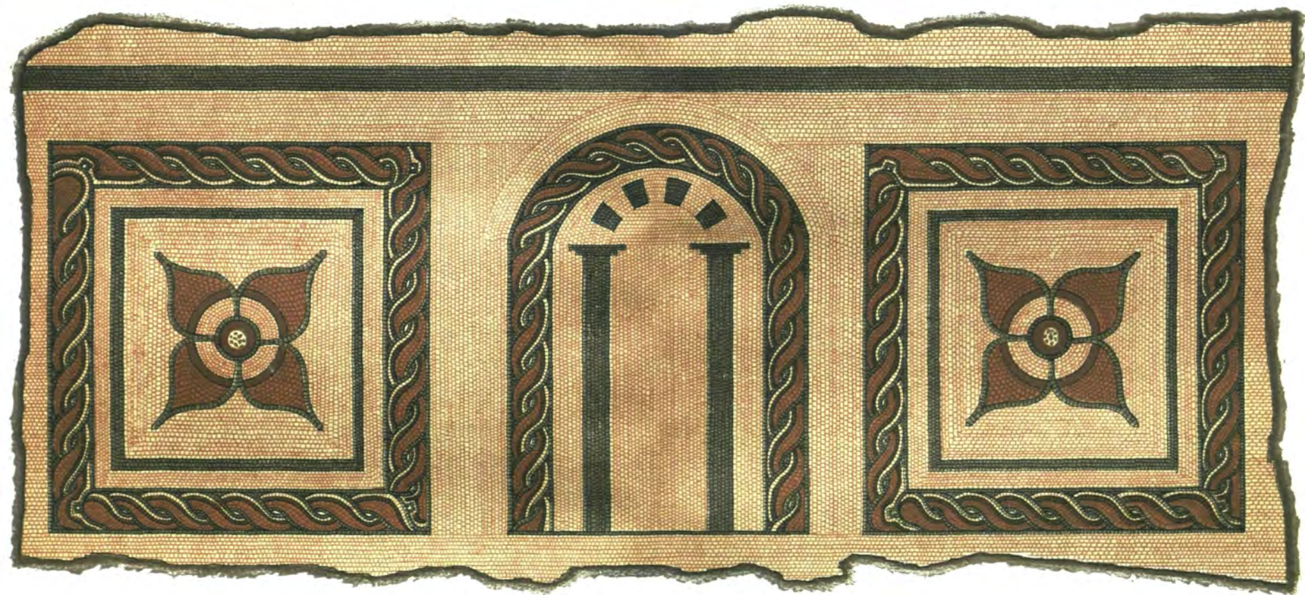
ROMAN PAVEMENT, DISCOVERED JUNE 20 TH 1758, IN HIGH ST R CANTERBURY, BESIDE THE KING'S HEAD INN.